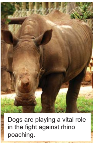
Dogs are playing a vital role in the fight against rhino poaching.