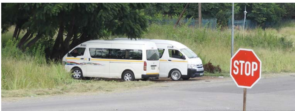
Taxi operators monitor a hitchhiking spot along the Rustenburg – Swartruggens road.

This follows numerous instances in which motorists have also been robbed by criminals whom they offered lifts to.