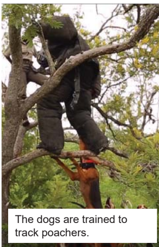
The dogs are trained to track poachers.